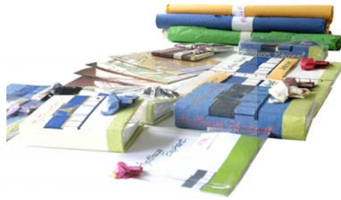
Figure 1 Prototype of elephant dung paper.