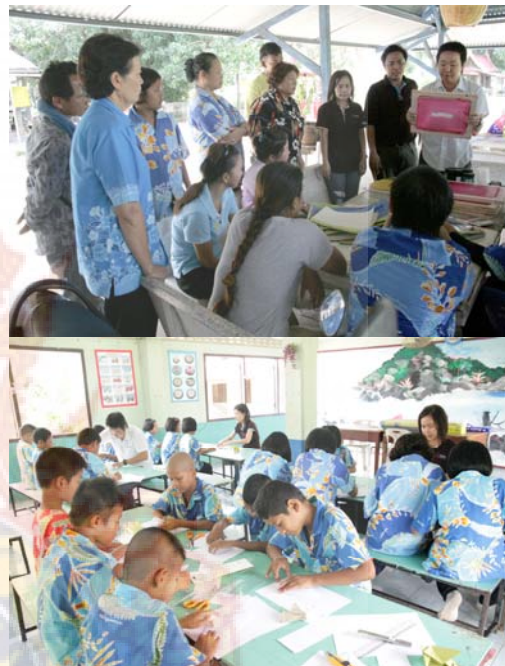
Figure 2 Transfer of technology to Community At Changwat Phra Nakhon Si Ayutthaya.