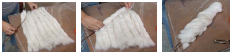
Fig.3 The angle 45 degree laying

4.4 To Study Ratio and weight of Sliver in GAREBO yarn TUBE. That are affect to Fancy yarn spinning as SLUB YARN. Planning experiment in 5x3 factorial Design and 50 tested repeats. From the factor is composed of 2 Factors as follow.