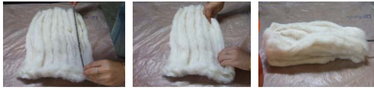
Fig.2 The longwise laying