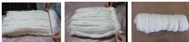
Fig.1 The crosswise laying