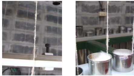
Fig.4 Present about spinning fancy yarn as SLUB YARN

twist too much, it can not draw to be. Threa Sometimes Thread is out large size all over line. Thus, the crosswise laying can not produce because. It was large too much to produce as textile.